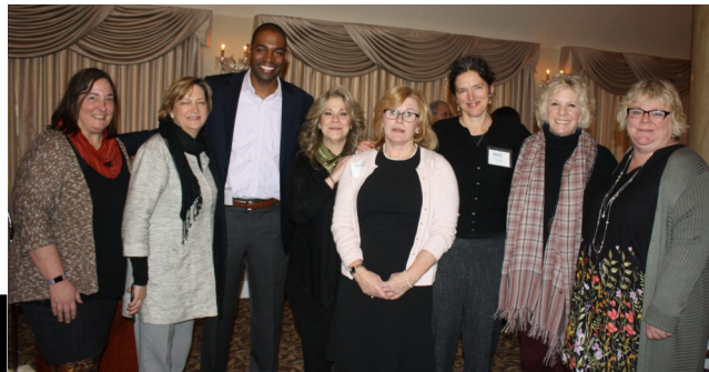
NYSUT members together with our newest congressman Antonio Delgado(D-19).